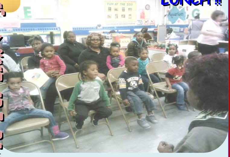
LEAP - Learning Enrichment Action Program