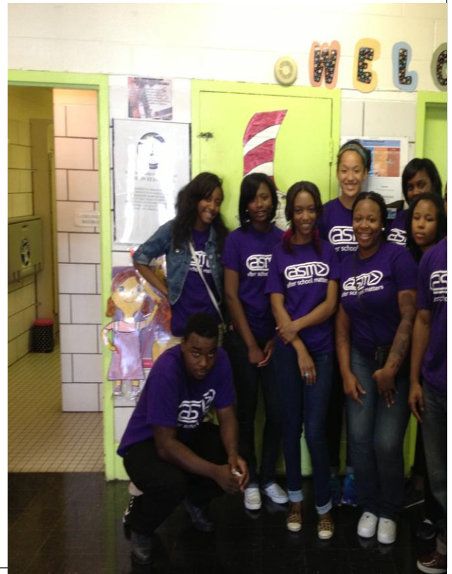
Firman Community Services Summer Interns

She's 17 and attends Simpson High School.